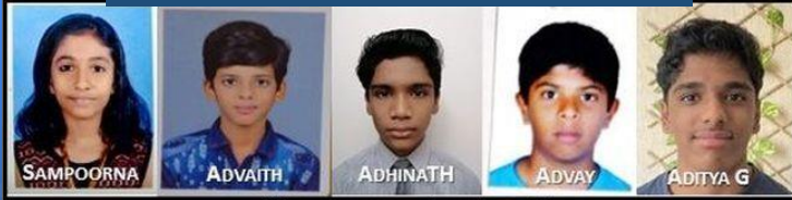
Group A Grades 8-9-10