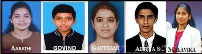
Group B Grades 11-12