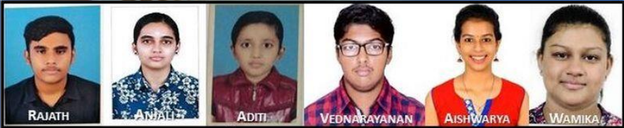
Group C Undergraduates